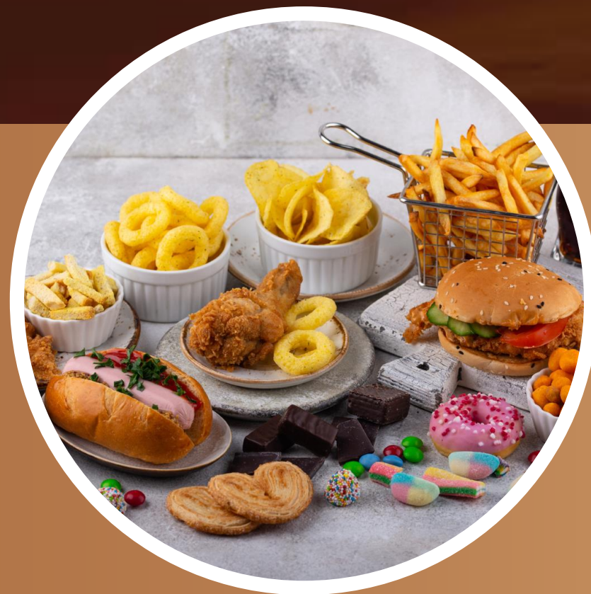
Poor Dietary Choices